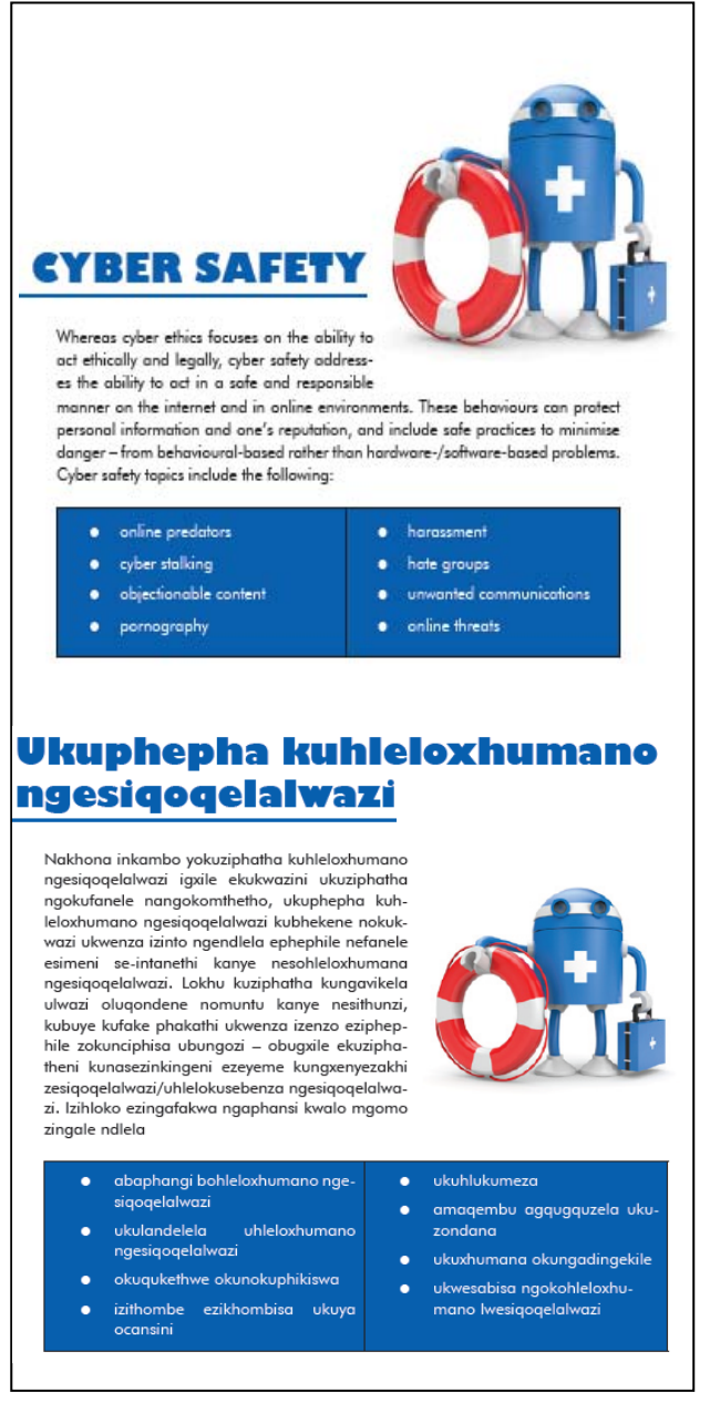
Figure 2: Posters in English and isiZulu

Pledges are inexpensive and a pledge form can be supplied to each school learner to sign and take home. This gives learners the opportunity to discuss cybersafety with their parents or caregivers. Growing an online safety culture includes both learners and their parents or guardians. Schools with internet access can download the pledge free of charge and distribute it among learners. However, these initiatives will have greater impact if combined with discussions and worksheets.