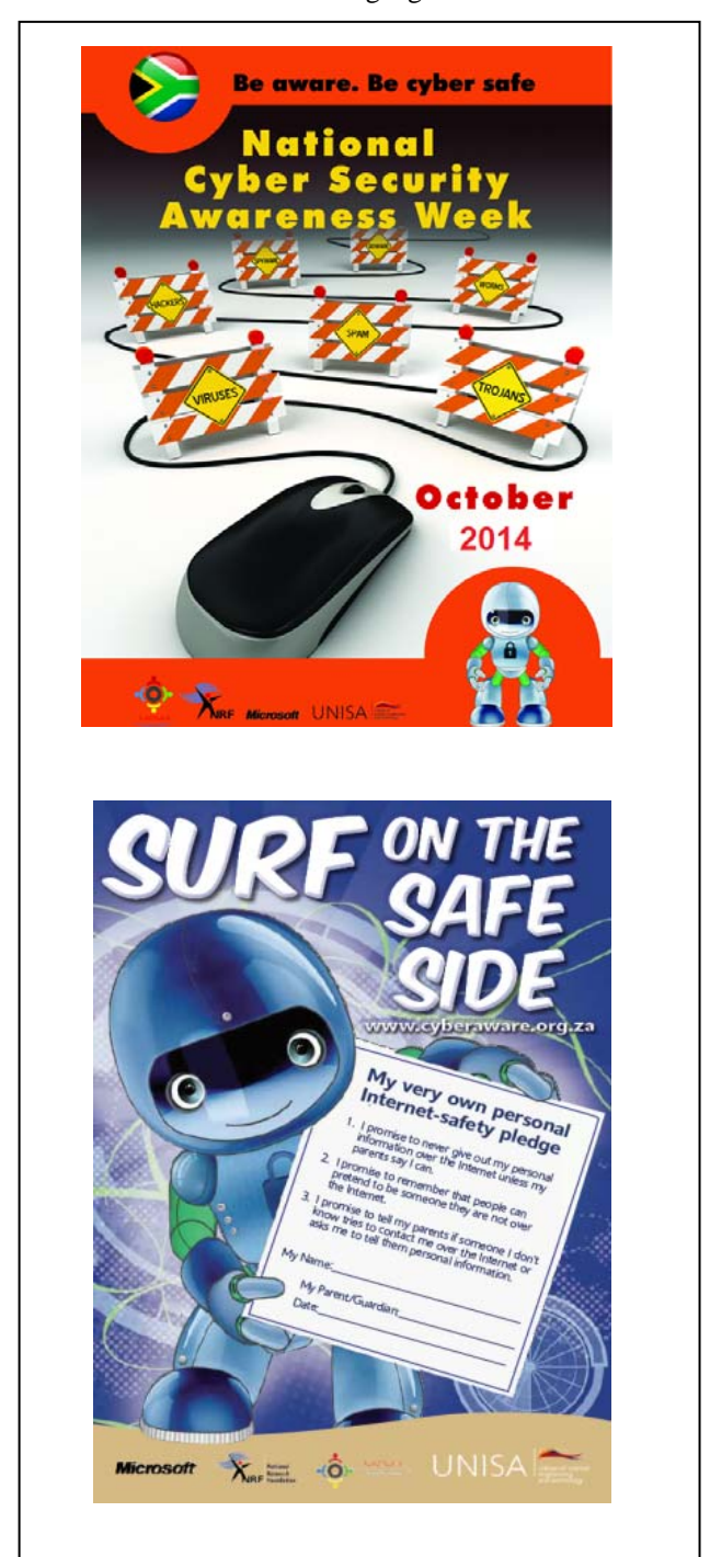
Figure 1: Posters and pledge

There are 11 official languages in South Africa, and the Constitution states that all school learners have the right to receive education in their own language.