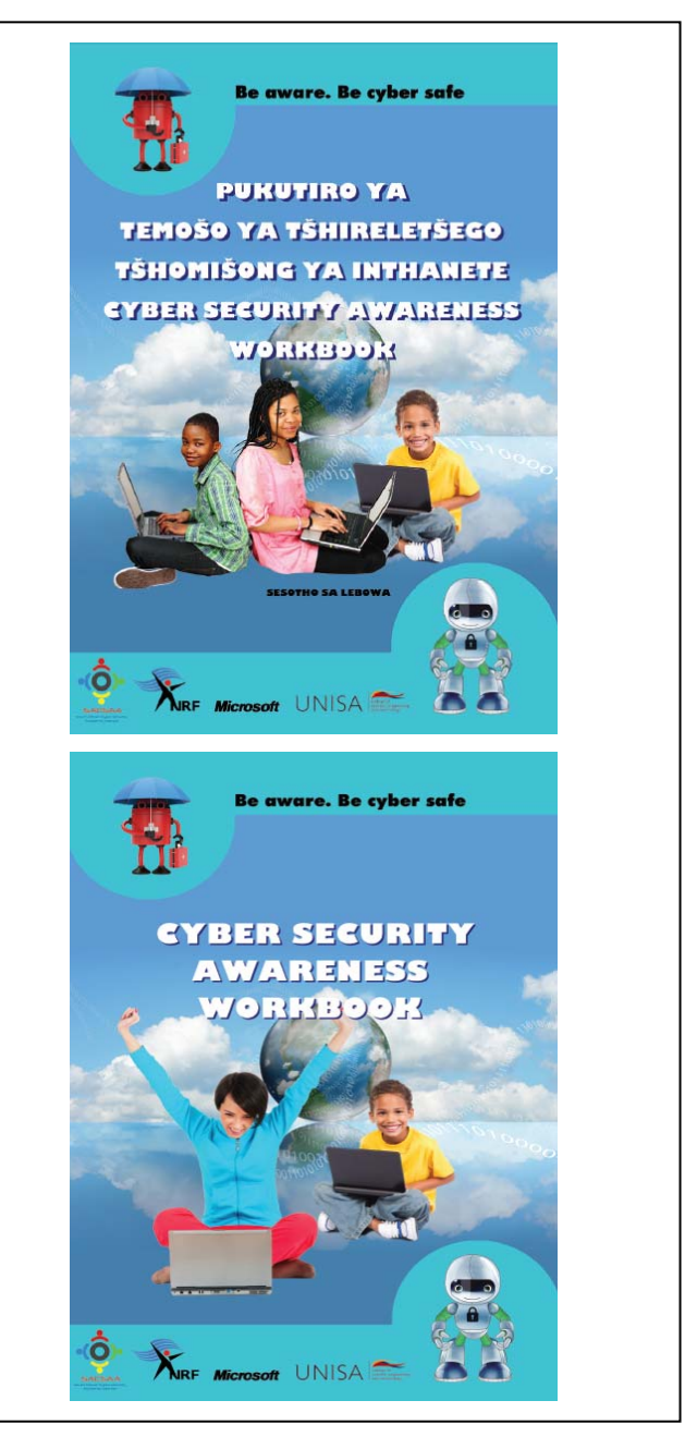
Figure 3: English and Sesotho versions of the workbook

on the different age. Figure 3 depicts the English and Sesotho versions of the workbook.